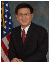
State Controller John Chiang